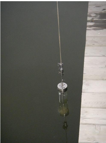
采水结束的 Ruttner 标准水样采集器