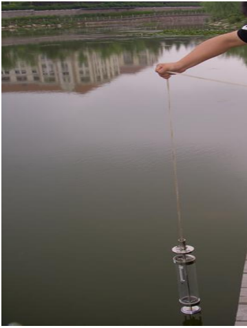
下水前的 Ruttner 标准水样采集器