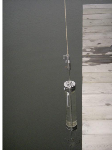
采水结束的 Ruttner 标准水样采集器