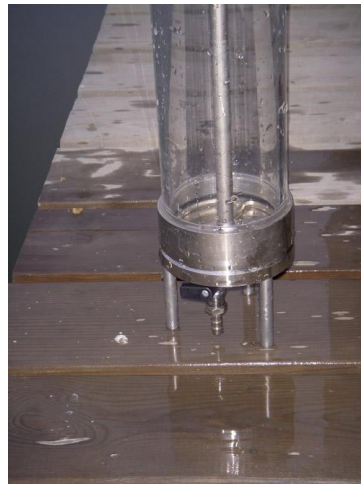
处于关闭状态的 Ruttner 标准水样采集器